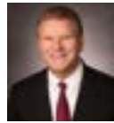
TILMAN J. FERTITTA