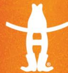
exhibit to travel and be displayed at the Texas Quilt Museum and the International Quilt Festival – Houston. Travel would be at the quilter’s discretion from approximately March 2025 – January 2026.

HLSR will insure each accepted entry against damage from the time we receive the entry until it is in the hands of the return courier, up to the value amount on the entry form or maximum of $500, whichever value is lowest. It is highly recommended that entries valued over $500 be appraised and the entrant obtain additional insurance to cover any damage to the entry while in transit at the Show. Every attempt is made to ensure the security of your entry at the Show.